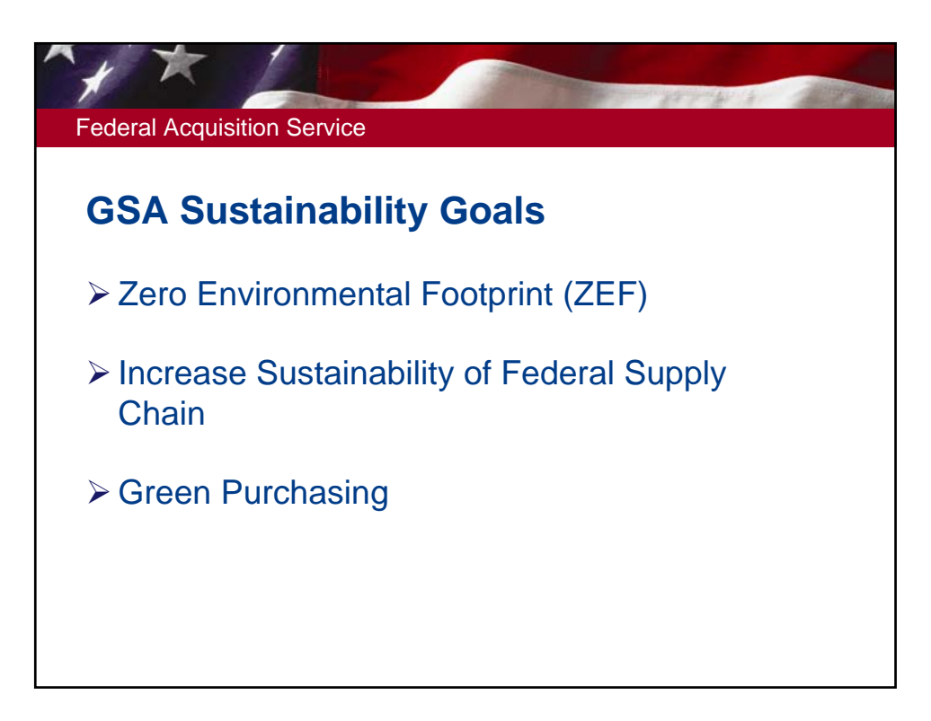
Page 1 of 4